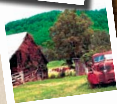
Third Place 2009

No entries will be accepted without completed and signed submission forms. Limit three photos per person.